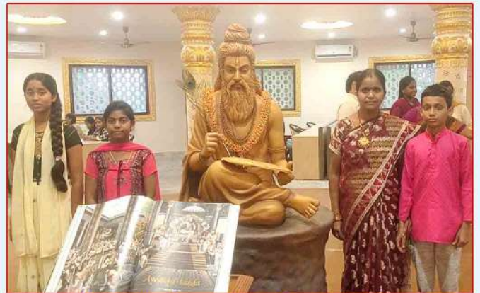
Participation of our students at Ramnarayanam