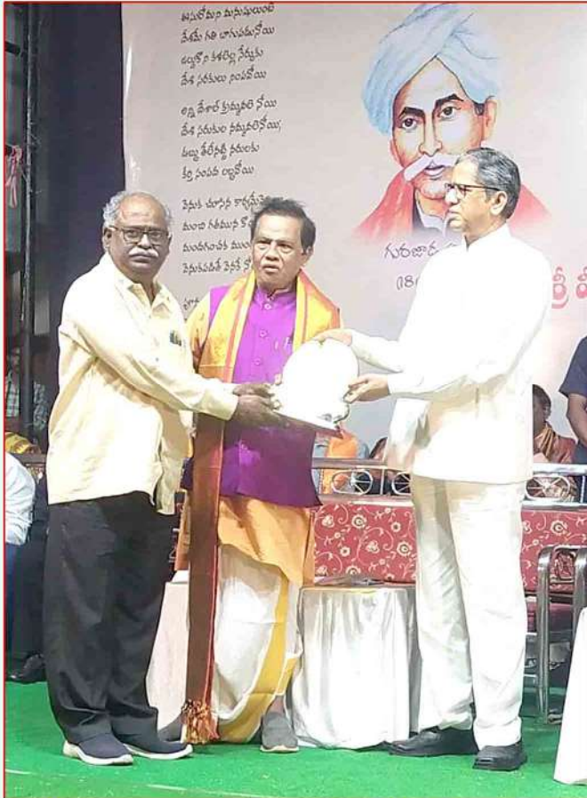
Memento given by Retd. Chief Justice Sri N. V. Ramana Garu on the occasion of GURAJADA VARDHANTI in Vizianagaram.