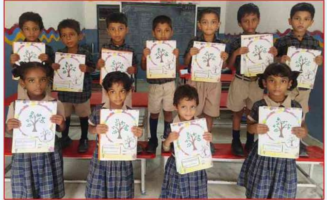
Activity Programme of UKG - B students