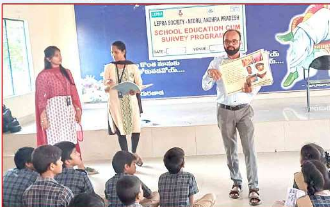
Motivation class by LEpra SOCIETY on THE AWARENESS OF SKIN DISEASES