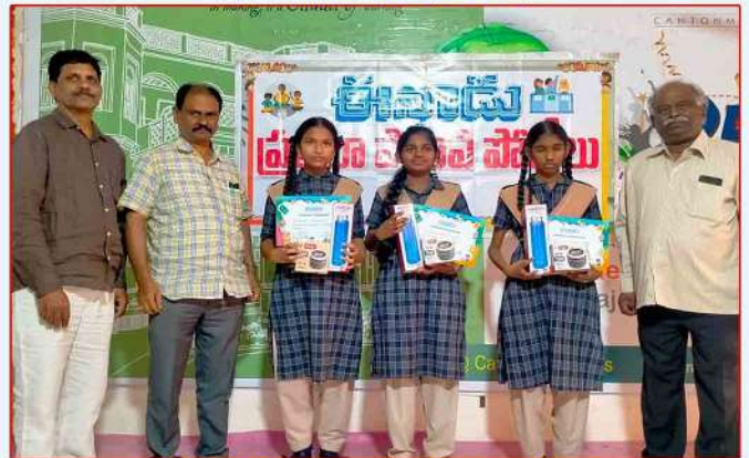
Winners of Eenadu Essay Writing competition with Management of Gurajada School