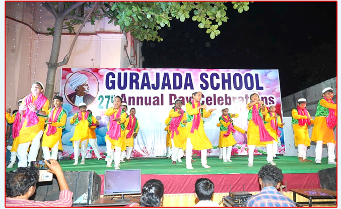
(18) VI th - G (Boys) - Song : Joru Joru Wala (Qwali)