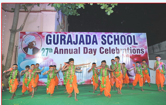
IInd A/B (Boys) - Jai Hanuman