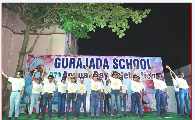
(20) VII th Boys - Best Comedy Show (Remix Dance)