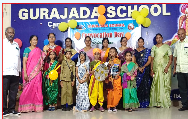
Fancy Dress Competitions held for Primary Class Children