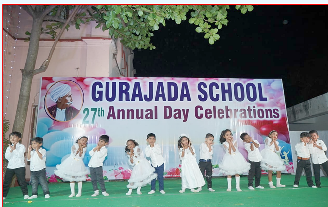
LKG (Boys / Girls) Tala Thala Merupulu - Lighting Stars