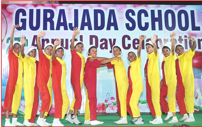
(17) VI th Boys - Funny Jokers