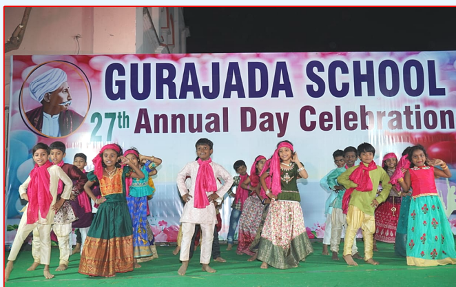
(9) Illrd B (Boys / Girsh) Kitch Kitch Kiya, Chekka Chekka adudam Dance