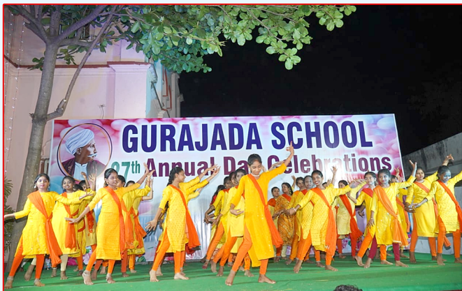
(19) VI th Girls - Ram Aayenge