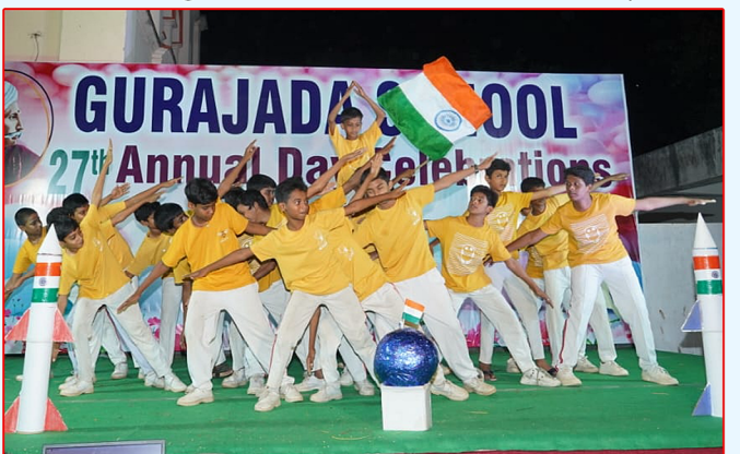
(24) VIII (Boys) - Chandrayan (about our Moon)