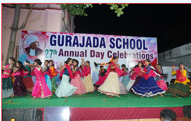
IVth A & B Girls (Garbha Dance)