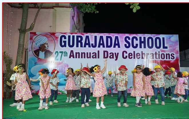
UKG (A/B) Song - O Maria, Pithase (Goa Dance)