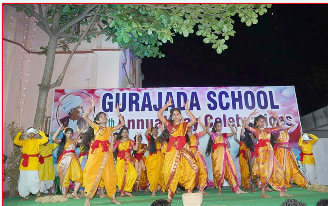
(21) VII - G (Girls) Song : Maa Vuru Pallituru (Greatness of Village)