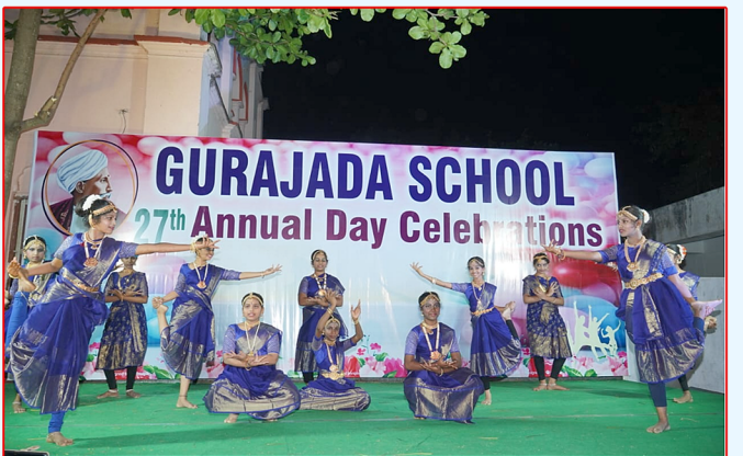
(22) VII - I (Girls) Rang Pooja Dance Programme of Peacock Structures