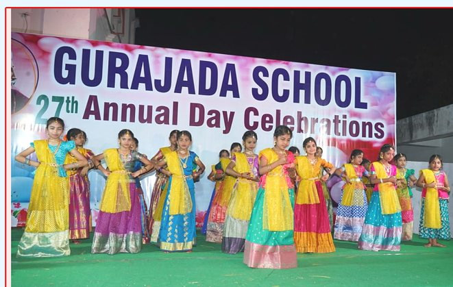
Vth A & B Girls - Mahakavi - Asamana Kavi