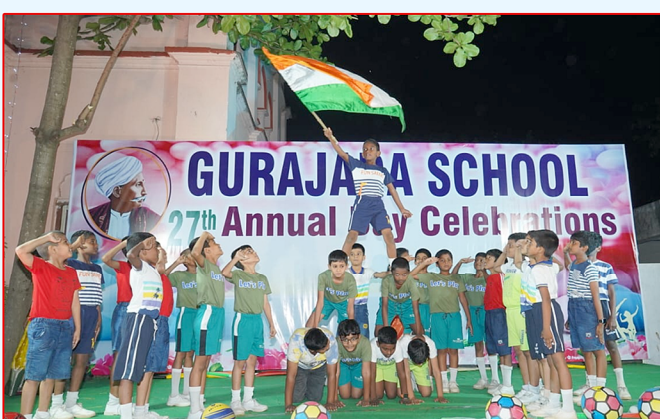
IVth A, B