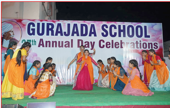
(27) VIII (Girls) Tribute to Freedom Fighters