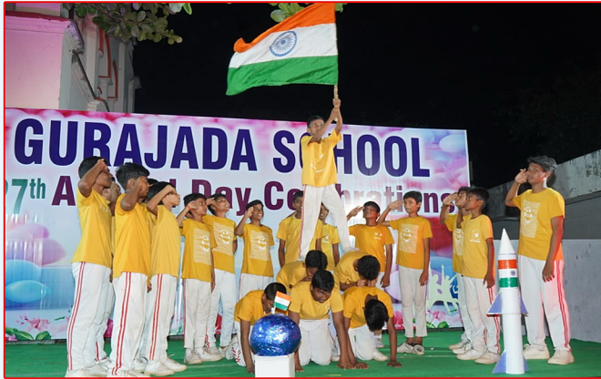
(25) VIII (Boys) - Chandrayan about Our Moon