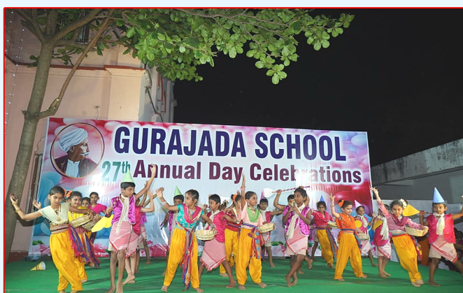
IIIRD A (Boys / Girls) Fisherman Dance