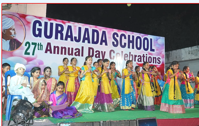
Vth A & B Girls - Mahakavi - Asamana Kavi