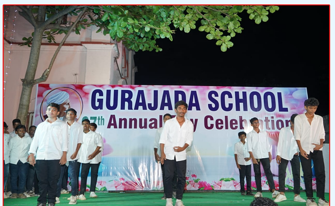
(28) IX (Boys) - Koi Kethata hae... (Remix Songs)