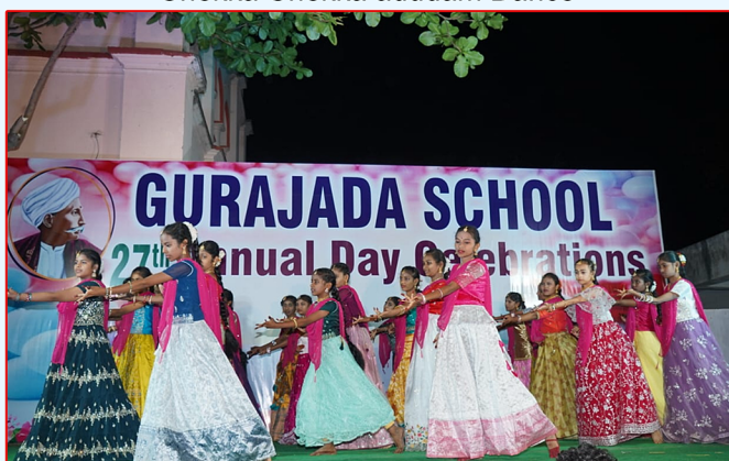
IVth Girls - Kothak Dance.... ( Remix Songs)