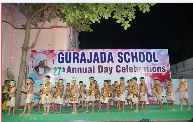
1st Class (Boys) Song - Tribal Dance