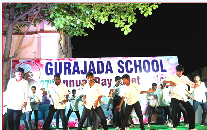
IVth Boys - Koi Kehata hae... ( Remix Songs)