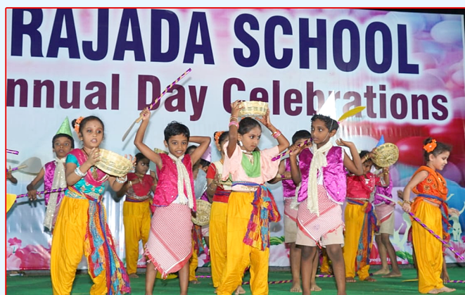
IIIRD A (Boys / Girls) - Fisherman Dance