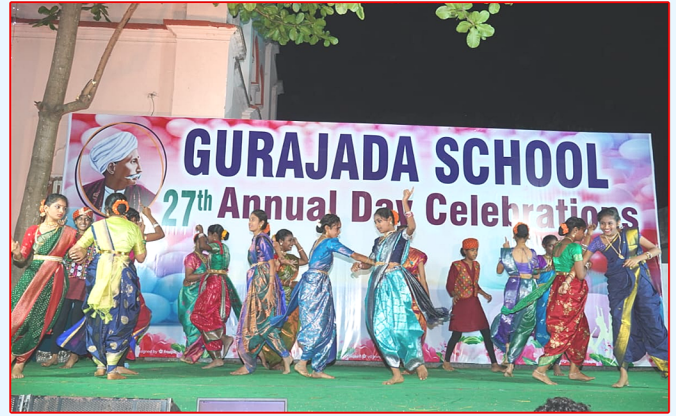
(26) VIII (Girls) - Raghupati Raghava