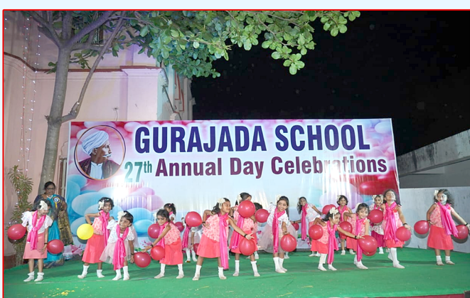
1st Class (Girls) Balloon Dance