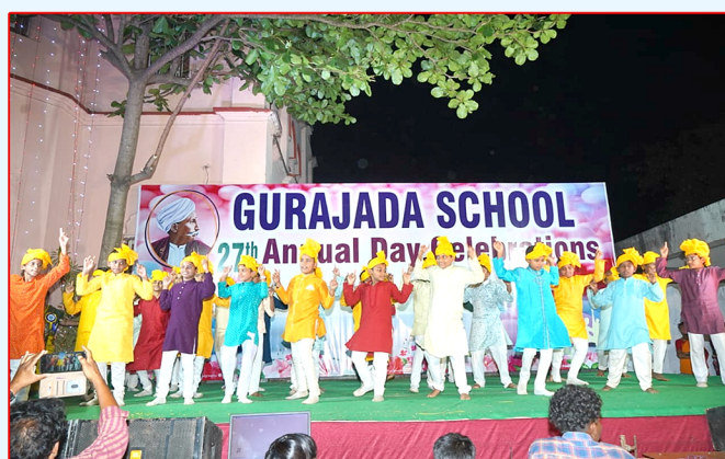
Vth A & B Boys - Bhangra (Punjabi)